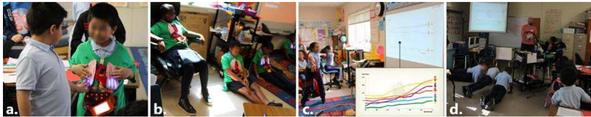
Figure 1. Our two WBI tools: (a, b) BodyVis displays live heart and breathing rates on a wearable, e-textile shirt while (c, d) SharedPhys uses a time-series graph representation projected on a large-screen display. Images (b) and (d) show children testing activities with BodyVis (resting) and SharedPhys (push-ups), respectively.

Through a design-based research approach (Sandoval & Bell, 2004), we iteratively designed scaffolds using participatory design with teachers, classroom deployments, and teacher and child feedback. Using a multiple case-study methodology (Yin, 2014), we identify similarities and differences among the authenticity of WBI projects and the influences of our iterated scaffolding from 2016 to 2017. Our findings illustrate how researchers can construct age-appropriate scaffolds for early learners conducting WBI.